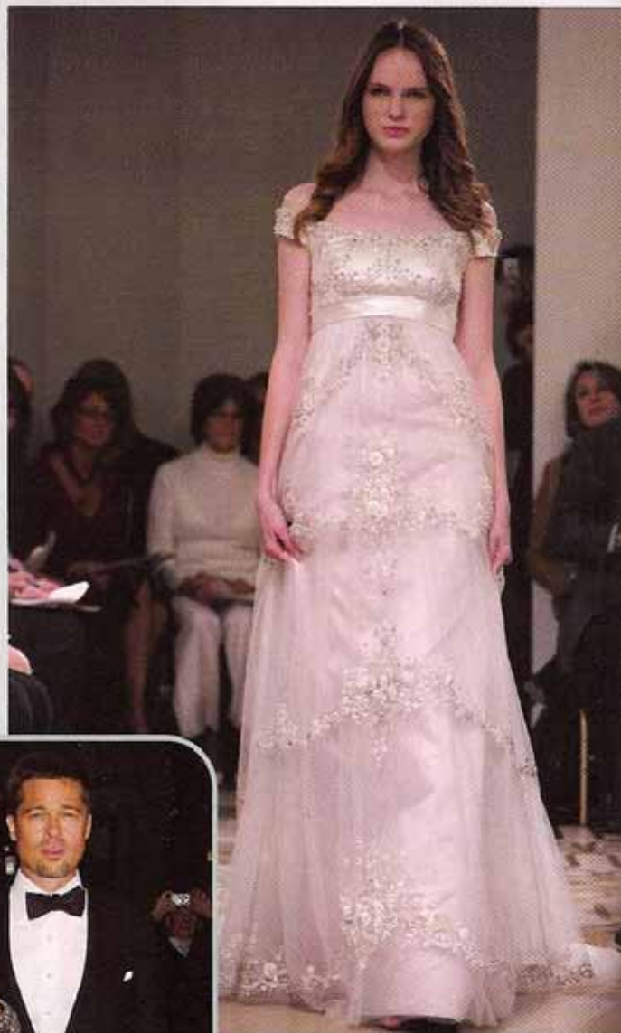
Actress Angelina Jolie (left), with partner Brad Pitt, wore a mocha Reem Acra caftan while pregnant at the Cannes Film Festival. Reem Acra’s empire waist wedding gowns (above) are ideal for pregnant brides.

That certainly holds true for actress Halle Berry, who recently welcomed a new daughter with her boyfriend, model Gabriel Aubry.